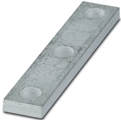
Connection rail, number of positions: 3, color: silver

Please be informed that the data shown in this PDF Document is generated from our Online Catalog. Please find the complete data in the user's documentation. Our General Terms of Use for Downloads are valid ( http://phoenixcontact.com/download )