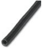
Galvanized steel protective hose with PVC coating

Protective hose - WP-STEEL PVC C 10 - 3240867