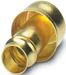
End sleeves as cable protection, made of brass, for WP-STEEL PVC C

Please be informed that the data shown in this PDF Document is generated from our Online Catalog. Please find the complete data in the user's documentation. Our General Terms of Use for Downloads are valid ( http://phoenixcontact.com/download )