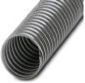
Protective hose in galvanized steel

Protective hose - WP-STEEL ZC 45 - 3240701