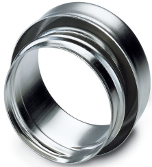
End sleeves as cable protection, made of brass

Please be informed that the data shown in this PDF Document is generated from our Online Catalog. Please find the complete data in the user's documentation. Our General Terms of Use for Downloads are valid ( http://phoenixcontact.com/download )