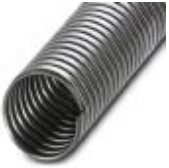
Protective hose in stainless steel

Protective hose - WP-STEEL S 45 - 3240690