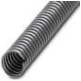
Protective hose in stainless steel

Protective hose - WP-STEEL S 27 - 3240864