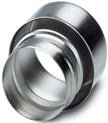
End sleeves as cable protection, made of brass

Please be informed that the data shown in this PDF Document is generated from our Online Catalog. Please find the complete data in the user's documentation. Our General Terms of Use for Downloads are valid ( http://phoenixcontact.com/download )