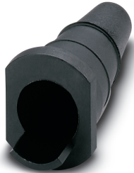
Bend protection sleeve, for cable diameter of 3 mm ... 9 mm, diameter: 12 mm, color: black

Please be informed that the data shown in this PDF Document is generated from our Online Catalog. Please find the complete data in the user's documentation. Our General Terms of Use for Downloads are valid ( http://phoenixcontact.com/download )