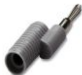
Reducing plug, color: gray