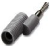
Reducing plug, color: gray