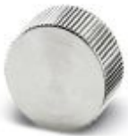
Metal protection cap for connectors with M17 external thread

Metal protective cap - ST-Z0014 - 1616069