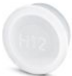
Plastic protection cap for connectors with M17 external thread

Metal protective cap - ST-Z0014 - 1616069