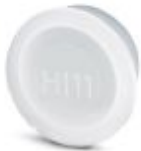
Plastic protection cap for connectors with M23 knurled nut

Plastic anti-static dust protection cap - RC-Z2468 - 1611796