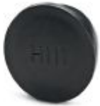
Plastic protection cap, antistatic, for connectors with M23 knurled nut

Plastic anti-static dust protection cap - RC-Z2468 - 1611796