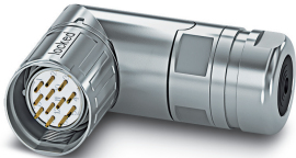
The figure shows the 12-pos. product version with solder contacts

Cable connector, CA, angled, shielded: yes, SPEEDCON locking, M23, No. of pos.: 16+2+PE, type of contact: Pin, Crimp connection, cable diameter range: 6 mm ... 10 mm, coding:N