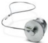
Metal protection cap with steel wire and loop, for M23 signal connectors with knurled nut for fastening to the cable

Metal protective cap - CA-Z0077 - 1627224