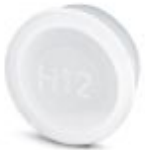
Plastic protection cap for connectors with M23 external thread

Plastic anti-static dust protection cap - RC-Z2469 - 1611797