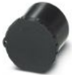
Plastic protection cap, with eye, IP40 for connectors with M23 external thread, RF, SF series