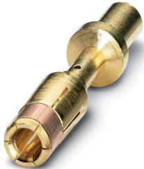
Crimp contact, contact diameter: 3.6 mm, crimp range: 16 mm 2 ... 16 mm 2

Please be informed that the data shown in this PDF Document is generated from our Online Catalog. Please find the complete data in the user's documentation. Our General Terms of Use for Downloads are valid ( http://phoenixcontact.com/download )