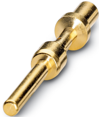
Crimp contact, turned, contact diameter: 3.6 mm, crimp range: 16 mm 2 ... 16 mm 2

Please be informed that the data shown in this PDF Document is generated from our Online Catalog. Please find the complete data in the user's documentation. Our General Terms of Use for Downloads are valid ( http://phoenixcontact.com/download )