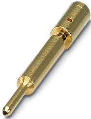
Crimp contact, turned, Single contact, contact diameter: 1 mm, crimp range: 0.5 mm 2 ... 1 mm 2

Please be informed that the data shown in this PDF Document is generated from our Online Catalog. Please find the complete data in the user's documentation. Our General Terms of Use for Downloads are valid ( http://phoenixcontact.com/download )