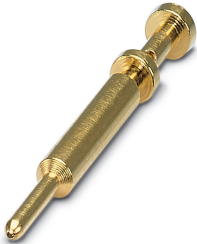
Crimp contact, turned, contact diameter: 1 mm, crimp range: 0.34 mm 2 ... 0.5 mm 2

Please be informed that the data shown in this PDF Document is generated from our Online Catalog. Please find the complete data in the user's documentation. Our General Terms of Use for Downloads are valid ( http://phoenixcontact.com/download )