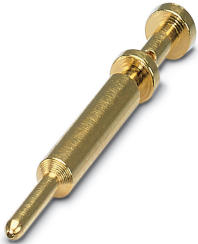
Crimp contact, turned, contact diameter: 1 mm, crimp range: 0.06 mm 2 ... 0.25 mm 2

Please be informed that the data shown in this PDF Document is generated from our Online Catalog. Please find the complete data in the user's documentation. Our General Terms of Use for Downloads are valid ( http://phoenixcontact.com/download )