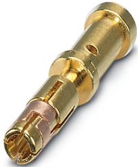
Crimp contact, turned, contact diameter: 1 mm, crimp range: 0.34 mm 2 ... 0.5 mm 2

Please be informed that the data shown in this PDF Document is generated from our Online Catalog. Please find the complete data in the user's documentation. Our General Terms of Use for Downloads are valid ( http://phoenixcontact.com/download )