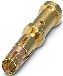
Crimp contact, turned, contact diameter: 1 mm, crimp range: 0.06 mm 2 ... 0.25 mm 2

Please be informed that the data shown in this PDF Document is generated from our Online Catalog. Please find the complete data in the user's documentation. Our General Terms of Use for Downloads are valid ( http://phoenixcontact.com/download )