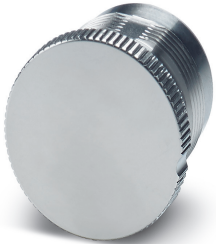
Metal protective cap for M23 Hybrid and power connectors with knurl

Please be informed that the data shown in this PDF Document is generated from our Online Catalog. Please find the complete data in the user's documentation. Our General Terms of Use for Downloads are valid ( http://phoenixcontact.com/download )