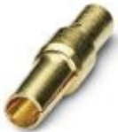
Crimp contact, turned, Single contact, contact diameter: 1 mm, crimp range: 0.08 mm 2 ... 0.22 mm 2