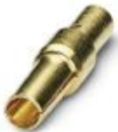
Crimp contact, turned, Single contact, contact diameter: 1 mm, crimp range: 0.5 mm 2 ... 1 mm 2