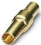
Crimp contact, turned, Single contact, contact diameter: 1 mm, crimp range: 0.14 mm 2 ... 0.56 mm 2