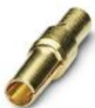
Crimp contact, turned, contact diameter: 2 mm, crimp range: 1 mm 2 ... 1.5 mm 2