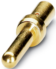
Crimp contact, turned, Single contact, contact diameter: 1 mm, crimp range: 0.14 mm 2 ... 0.56 mm 2

Please be informed that the data shown in this PDF Document is generated from our Online Catalog. Please find the complete data in the user's documentation. Our General Terms of Use for Downloads are valid ( http://phoenixcontact.com/download )