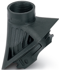
Adapter, plastic, for EVO housing, M20 thread

Please be informed that the data shown in this PDF Document is generated from our Online Catalog. Please find the complete data in the user's documentation. Our General Terms of Use for Downloads are valid ( http://phoenixcontact.com/download )