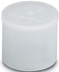
Protective cap, transparent plastic, for 5 x 2.5 mm 2 QPD connector, IP50.

Please be informed that the data shown in this PDF Document is generated from our Online Catalog. Please find the complete data in the user's documentation. Our General Terms of Use for Downloads are valid ( http://phoenixcontact.com/download )