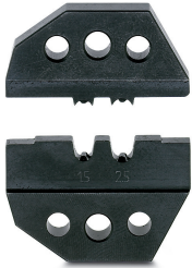
Spare die for CRIMPFOX-TC 2,5

Please be informed that the data shown in this PDF Document is generated from our Online Catalog. Please find the complete data in the user's documentation. Our General Terms of Use for Downloads are valid ( http://phoenixcontact.com/download )