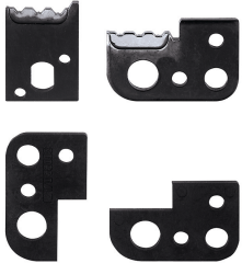
Replacement die for CRIMPFOX-1,6/2,5-ED-2,50

Please be informed that the data shown in this PDF Document is generated from our Online Catalog. Please find the complete data in the user's documentation. Our General Terms of Use for Downloads are valid ( http://phoenixcontact.com/download )