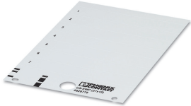
The figure shows a version of the product

Snap-in markers, Card, yellow, unlabeled, can be labeled with: BLUEMARK ID COLOR, BLUEMARK ID, THERMOMARK PRIME, THERMOMARK CARD 2.0, THERMOMARK CARD, mounting type: snapped into marker carrier, lettering field size: 27 x 8 mm, Number of individual labels: 51