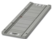
Magazine, for CMS-P1-PLOTTER, for accommodating UC1-TM..., UC1U-TM...