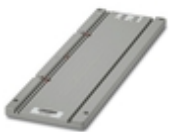
Magazine, for CMS-P1-PLOTTER and PLOTMARK, for accommodating UC-EMP..., UC-EMLP...