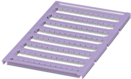
The figure shows the white version

Marker for terminal blocks, can be ordered: by sheet, violet, labeled according to customer specifications, mounting type: snap into flat marker groove, for terminal block width: 5.2 mm, lettering field size: 4.6 x 5.1 mm, Number of individual labels: 96