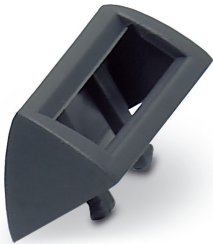
Marker carrier, for SS-ZB contactor marking Zack marker strip

Please be informed that the data shown in this PDF Document is generated from our Online Catalog. Please find the complete data in the user's documentation. Our General Terms of Use for Downloads are valid ( http://phoenixcontact.com/download )