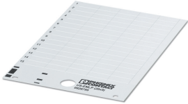
The figure shows the US-EMLP (20x9) version

Plastic label, Card, red, unlabeled, can be labeled with: BLUEMARK ID COLOR, BLUEMARK ID, THERMOMARK PRIME, THERMOMARK CARD 2.0, THERMOMARK CARD, mounting type: adhesive, lettering field size: 27 x 8 mm, Number of individual labels: 51