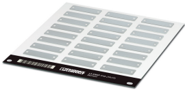
The figure shows version

Device marker, Stainless steel label, silver, unlabeled, can be labeled with: TOPMARK NEO, TOPMARK LASER, mounting type: screw, rivet, lettering field size: 50 x 30 mm