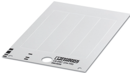
The figure shows a similar product

Snap-in markers, insert label, for marking Siemens S-7-1500 controllers, card, gray, unmarked, can be marked with: THERMOMARK CARD, mounting type: snapped into marker carrier, lettering field size: 23 x 109 mm