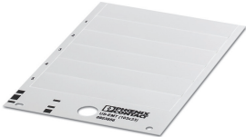
The figure shows a similar product

Snap-in markers, insert label, for marking Siemens S-7-300 controllers, card, turquoise, unmarked, can be marked with: THERMOMARK CARD, mounting type: snapped into marker carrier, lettering field size: 103 x 23 mm