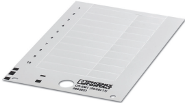
The figure shows a similar product

Snap-in markers, insert label, for marking Siemens ET 200S controllers, card, turquoise, unmarked, can be marked with: THERMOMARK CARD, mounting type: snapped into marker carrier, lettering field size: 1 of 50 x 13 mm and 1 of 28 x 13 mm