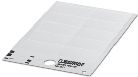
The figure shows a similar product

Snap-in markers, insert label, for marking Siemens ET 200S controllers, card, turquoise, unmarked, can be marked with: THERMOMARK CARD, mounting type: snapped into marker carrier, lettering field size: 50 x 26 mm