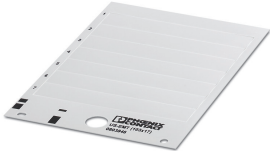
The figure shows a similar product

Snap-in markers, insert label, for marking Siemens S7-300 controllers, card, turquoise, unmarked, can be marked with: THERMOMARK CARD, mounting type: snapped into marker carrier, lettering field size: 103 x 17 mm