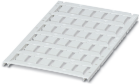
The figure shows version

Please be informed that the data shown in this PDF Document is generated from our Online Catalog. Please find the complete data in the user's documentation. Our General Terms of Use for Downloads are valid ( http://phoenixcontact.com/download )