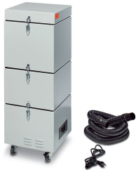
Extraction unit: 120 V

Please be informed that the data shown in this PDF Document is generated from our Online Catalog. Please find the complete data in the user's documentation. Our General Terms of Use for Downloads are valid ( http://phoenixcontact.com/download )