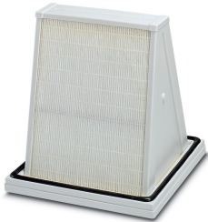
MP-TEC fine particle filter, for replacement

Please be informed that the data shown in this PDF Document is generated from our Online Catalog. Please find the complete data in the user's documentation. Our General Terms of Use for Downloads are valid ( http://phoenixcontact.com/download )