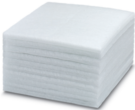
Pre-filter pad, for replacement

Please be informed that the data shown in this PDF Document is generated from our Online Catalog. Please find the complete data in the user's documentation. Our General Terms of Use for Downloads are valid ( http://phoenixcontact.com/download )