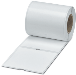
Label, white, labeled, mounting type: adhesive, lettering field size: 100 x 90 mm

Please be informed that the data shown in this PDF Document is generated from our Online Catalog. Please find the complete data in the user's documentation. Our General Terms of Use for Downloads are valid ( http://phoenixcontact.com/download )