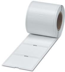
Label, white, labeled, mounting type: adhesive, lettering field size: 70 x 50 mm

Please be informed that the data shown in this PDF Document is generated from our Online Catalog. Please find the complete data in the user's documentation. Our General Terms of Use for Downloads are valid ( http://phoenixcontact.com/download )