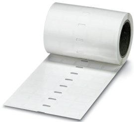
Label, Roll, white, labeled, mounting type: adhesive, lettering field size: 15 x 9 mm

Please be informed that the data shown in this PDF Document is generated from our Online Catalog. Please find the complete data in the user's documentation. Our General Terms of Use for Downloads are valid ( http://phoenixcontact.com/download )