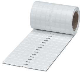
Label, Roll, white, labeled, mounting type: adhesive, lettering field size: 10 x 4 mm

Please be informed that the data shown in this PDF Document is generated from our Online Catalog. Please find the complete data in the user's documentation. Our General Terms of Use for Downloads are valid ( http://phoenixcontact.com/download )