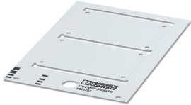
The figure shows the US-EMSP (75,6x54) version

Device marker, Card, red, unlabeled, can be labeled with: BLUEMARK ID COLOR, BLUEMARK ID, THERMOMARK PRIME, THERMOMARK CARD 2.0, THERMOMARK CARD, mounting type: screw, rivet, lettering field size: 90 x 60 mm, Number of individual labels: 2