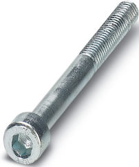
M4 replacement screw with 4 mm Allen screw head for sealing frame with screw locking

Please be informed that the data shown in this PDF Document is generated from our Online Catalog. Please find the complete data in the user's documentation. Our General Terms of Use for Downloads are valid ( http://phoenixcontact.com/download )