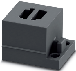
Small, slotted cable sleeves suitable for two AS-i cables (R-R), material: NBR, version: right, right

Please be informed that the data shown in this PDF Document is generated from our Online Catalog. Please find the complete data in the user's documentation. Our General Terms of Use for Downloads are valid ( http://phoenixcontact.com/download )