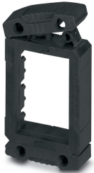
Sealing frame with locking latch, size B10, with flat gasket, for 6 small sleeves

Please be informed that the data shown in this PDF Document is generated from our Online Catalog. Please find the complete data in the user's documentation. Our General Terms of Use for Downloads are valid ( http://phoenixcontact.com/download )