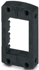
Sealing frame with screw locking, size B10, with flat gasket, for 6 small sleeves

Please be informed that the data shown in this PDF Document is generated from our Online Catalog. Please find the complete data in the user's documentation. Our General Terms of Use for Downloads are valid ( http://phoenixcontact.com/download )